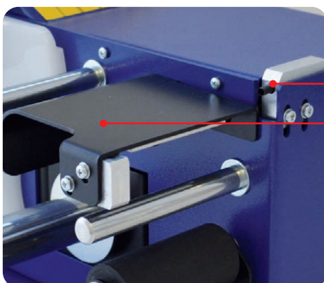
Sensor for label detection