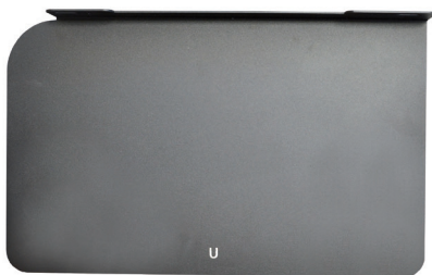
Unwinder printer plate