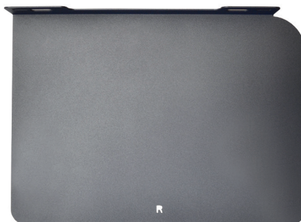
Rewinder printer plate